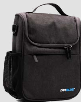
DOTBLUE HANDLEBAR BAG