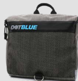
DOTBLUE HANDLEBAR BAG