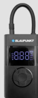
PORTABLE AIR COMPRESSOR