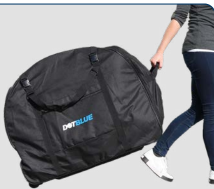
DOTBLUE ROLLING TRANSPORT BAG