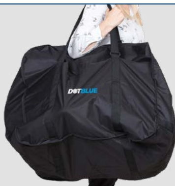
DOTBLUE TRANSPORT BAG