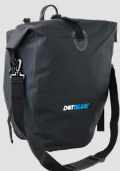
DOTBLUE LUGGAGE RACK BAG